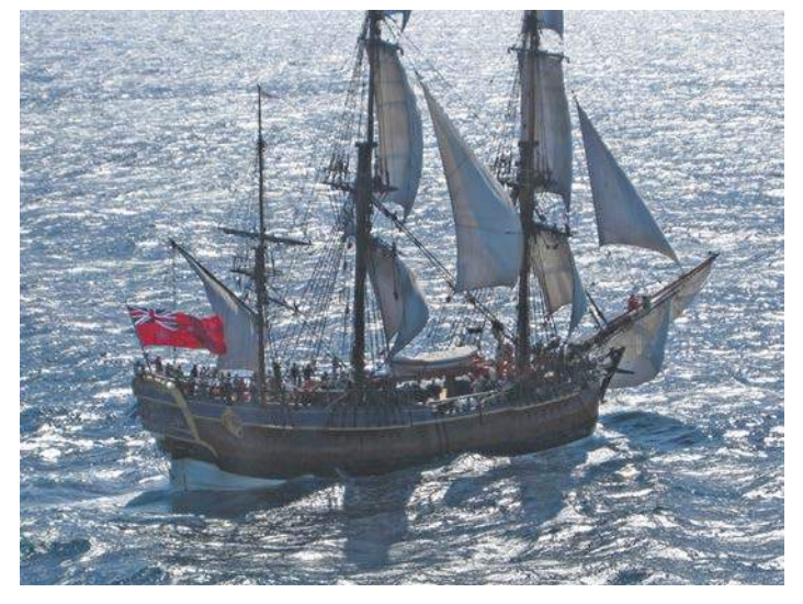
Replica of HMS Endeavour . Taken from the deck of the Queen Mary 2 by Ian Chambers.

There is some excitement in Australia about the possible discovery of Captain Cook's HMS Endeavour off the east coast of the USA. The Australian National Museum is planning an exhibition to mark the 250th anniversary of Cook's arrival in Australia in 2020. So let's hope by then the wreck is definitely confirmed to be the Endeavour and complications such as who owns the artifacts are resolved.