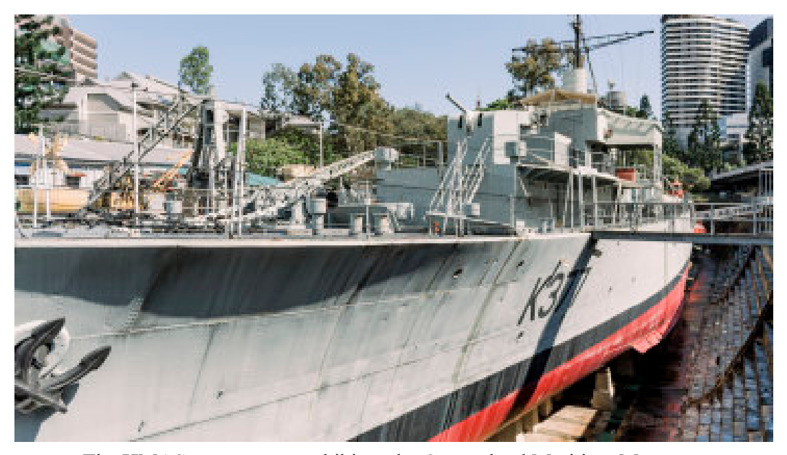
The HMAS Diamantina exhibit at the Queensland Maritime Museum.

The closure is especially sad as in 2021 the WMM would have celebrated its 50<sup>th</sup> anniversary. For more information see https://maritimemuseum.com.au/.