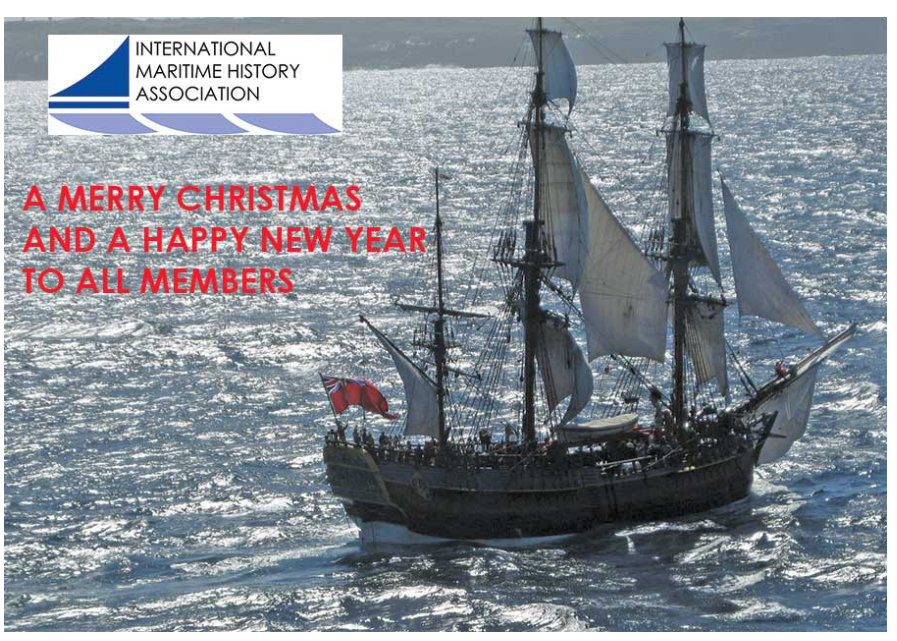
HMS Endeavour photographed from Queen Mary 2